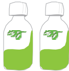
Two bottles of CLENPIQ (5.4 oz each)